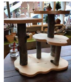
Four Level Mansion