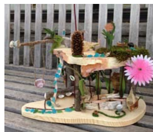
Two Level Bungalow

♥ Refurbish and renovate or add a level to your existing treehouse. $20.