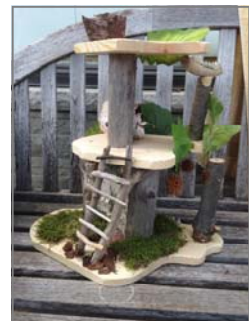
Three Level Triplex