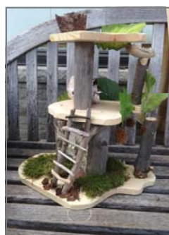
Three Level Triplex