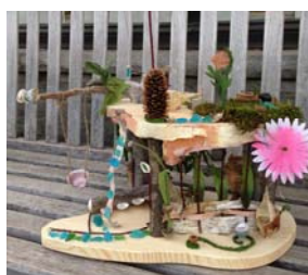
Two Level Bungalow