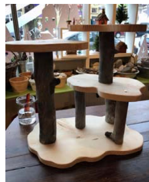
Four Level Mansion