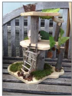
Three Level Triplex