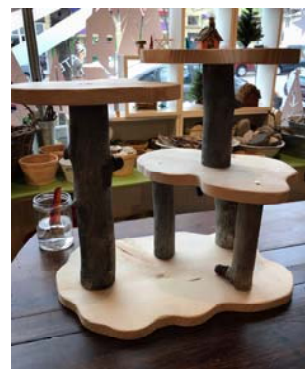
Four Level Mansion