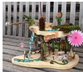
Two Level Bungalow